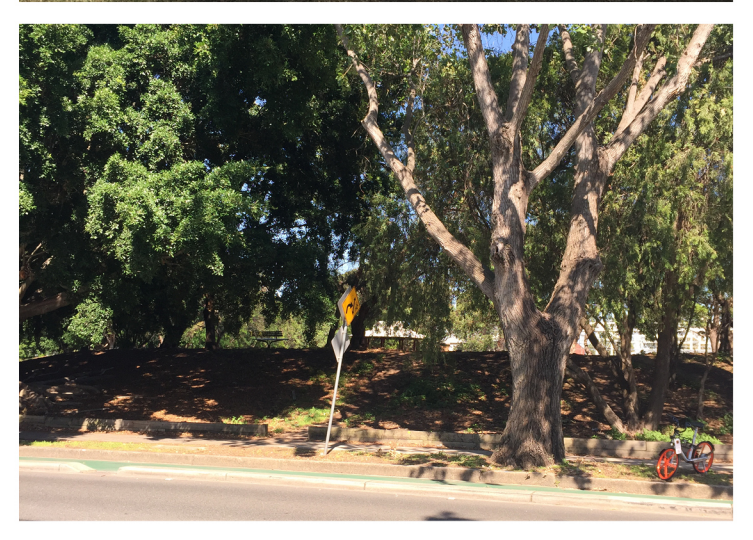
Existing view from Bourke Road looking west into the site.

Existing view from the south-eastern corner of the site looking north-west across the field.